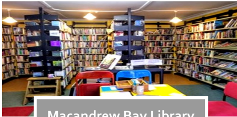
Macandrew Bay Library

The library's project to get an electronic system of borrowing up and running is slowly moving forward, with the completion of Phase 2 earlier in the year.